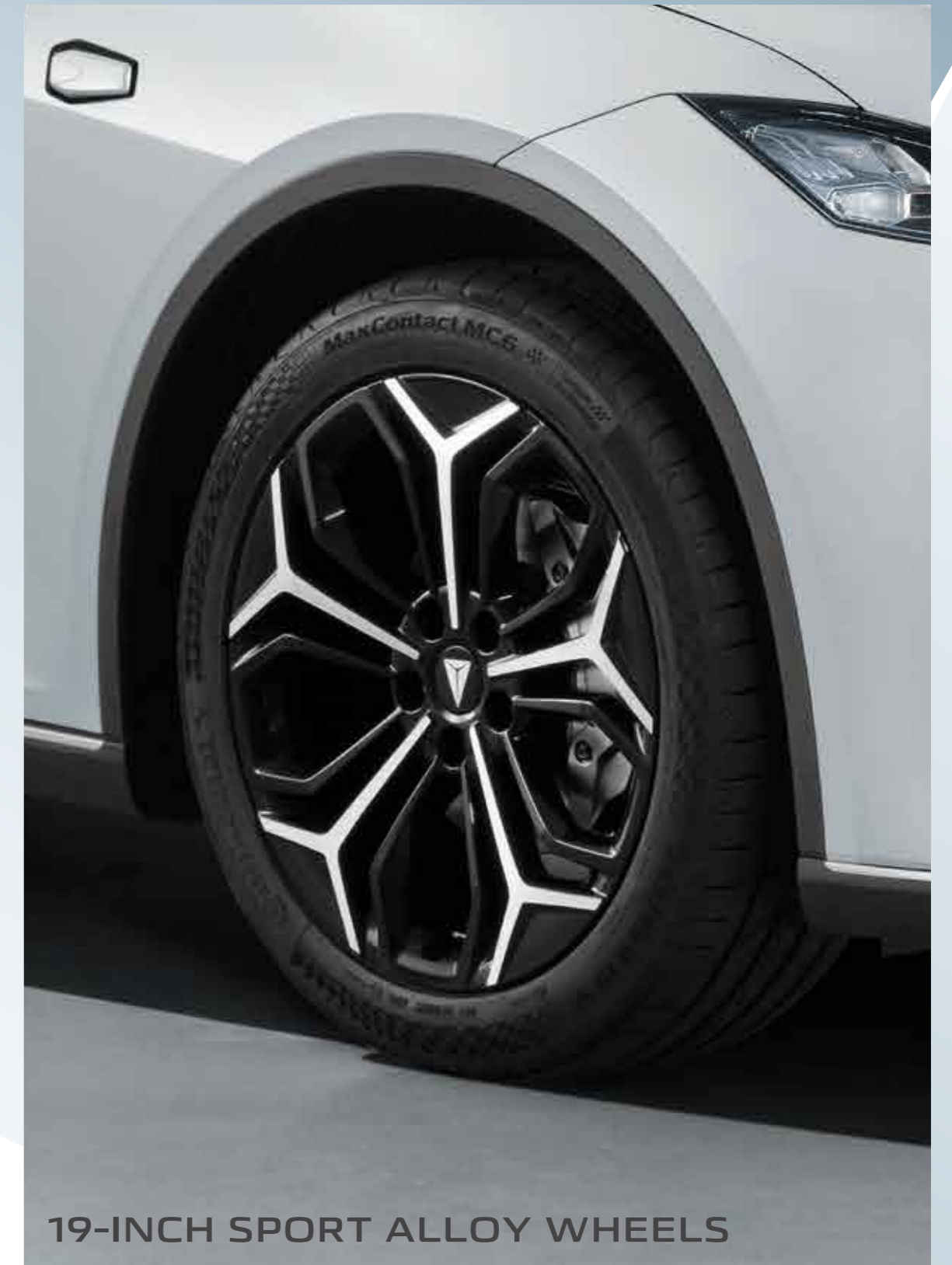
19-INCH SPORT ALLOY WHEELS