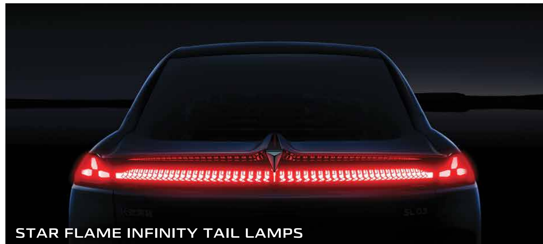
STAR FLAME INFINITY TAIL LAMPS