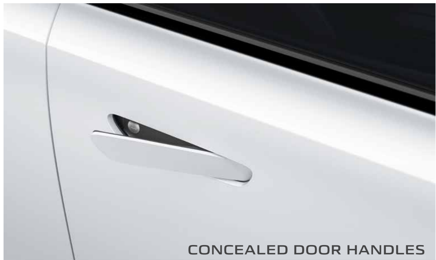
CONCEALED DOOR HANDLES