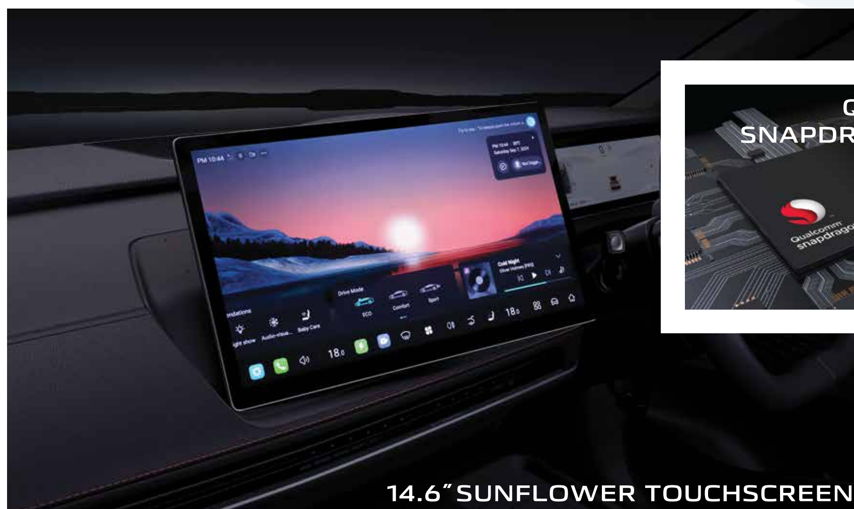
14.6" SUNFLOWER TOUCHSCREEN