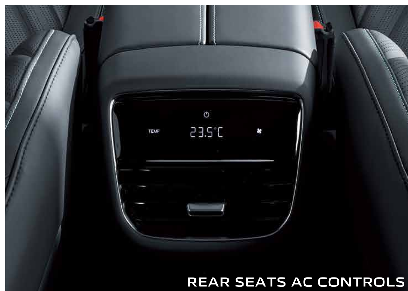
REAR SEATS AC CONTROLS